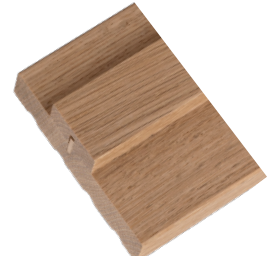
Double Rabbeted Combo Jamb