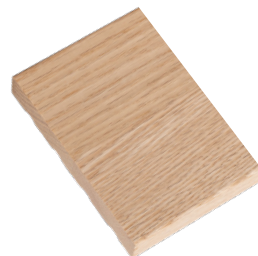
Flat Jamb (Stop Supplied)