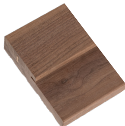
Single Rabbet With Kerf